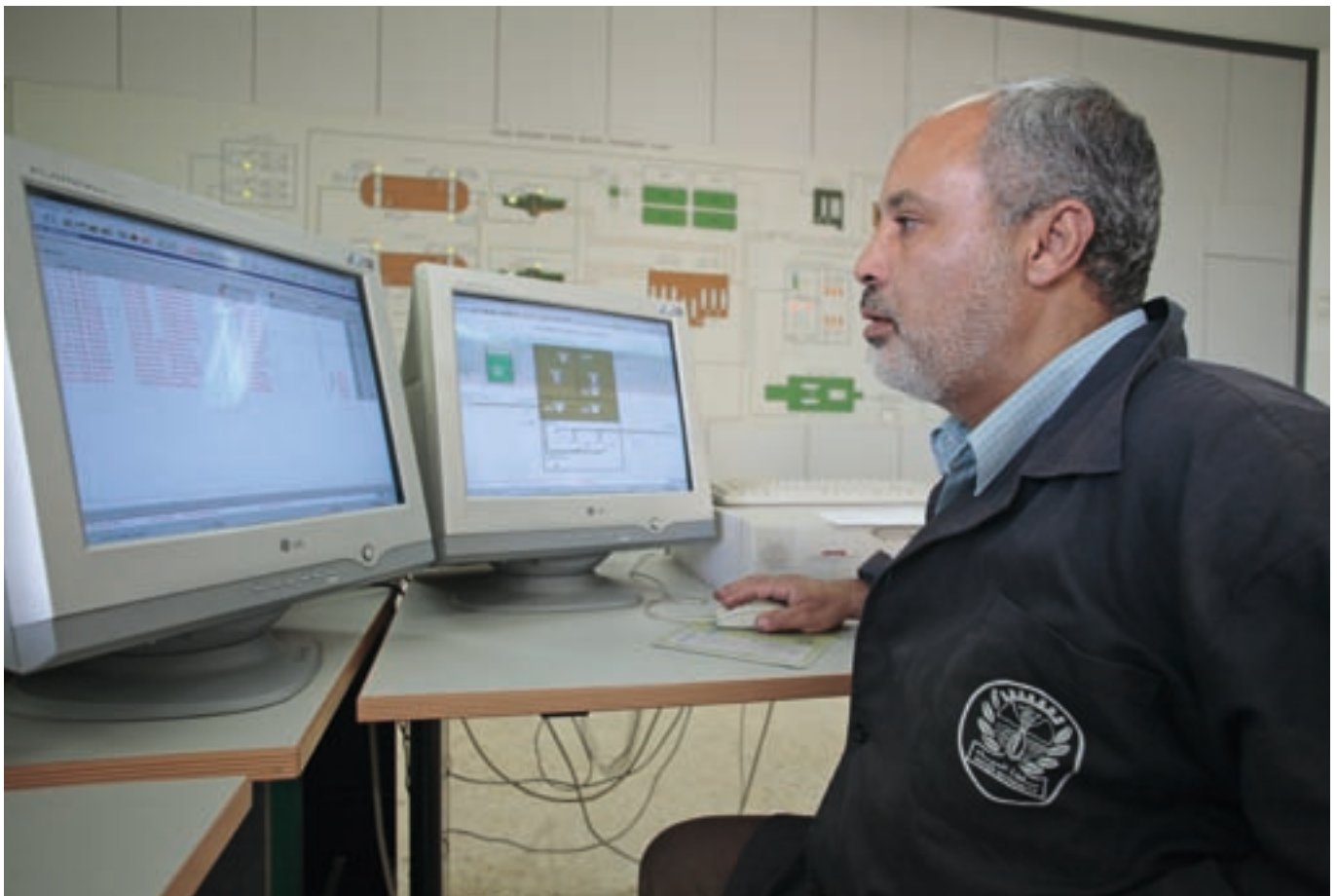
Employee at a sewage treatment plant working on a PC in a control room; November 2008, Jordan

In Egypt, the electricity sector is relatively well developed. In spite of continuing modernisation, there are still many (thermal) power plants with low levels of efficiency and high emissions of pollutants in operation. These are operated with gas or heavy oil. At the start of the 1980s, the Ministry of Electricity and Energy included increased use of renewable energies as an integral part of its national energy plan. In terms of long-term provisions for environmentally compatible energy supply and to prevent supply bottlenecks, in 1982 the Egyptian government decided on a programme to research, develop and implement renewable energies. In 1986,